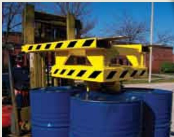
Custom L4F with Overhead Fork Lifting Arrangement.

Are you looking for a custom drum handling solution for a problem in your plant, lab or warehouse? Since 1947, Liftomatic has specialized in finding creative, economical solutions to handling all varieties of steel, plastic and fiber drums. Armed with practical experience and the latest engineering tools, we'll work with you to find a good solution. Tell us about your custom drum handling needs and let's discuss how Liftomatic's 65 years of custom experience can benefit your plant or warehouse.