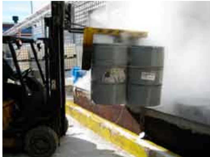
This Liftomatic Ruggedized Drum Bath Unit proves it can take the heat.

This photo exhibits that we “walk-the-walk” when we say Liftomatic builds them tough. This ruggedized L4F unit is used to place and extract drums to and from a steam bath operation. High temperatures and high humidity would cause lesser equipment to fail, yet this 4-drum unit just keeps taking a pounding and coming back for more. We build ‘em right so you don’t have to worry about what conditions you encounter.